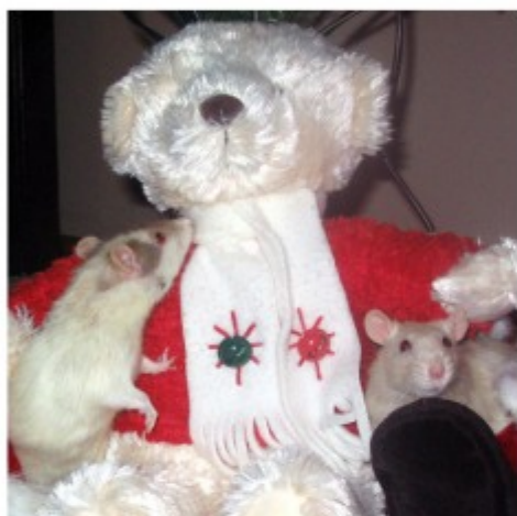
VIOLET & SUNNY